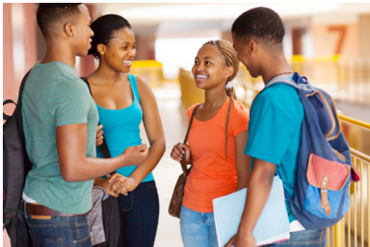
Emotional Regulation Activities for Tweens and Teens (Edutopia)