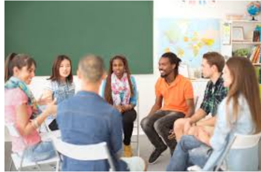
Who Do You Call On? Rooting Out Implicit Bias (Edutopia)