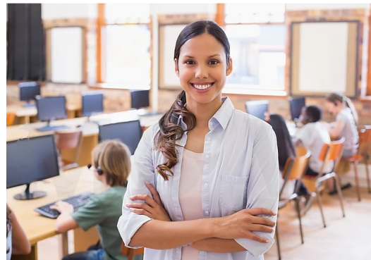
Weaving Anti-Bias and Equity into Curricula Begins with Self-Reflection (K12 Dive)